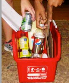
In-room recycling bins

Other recyclables: Bring your batteries (all types), printer cartridges, and electronics to the Facilities Management office.